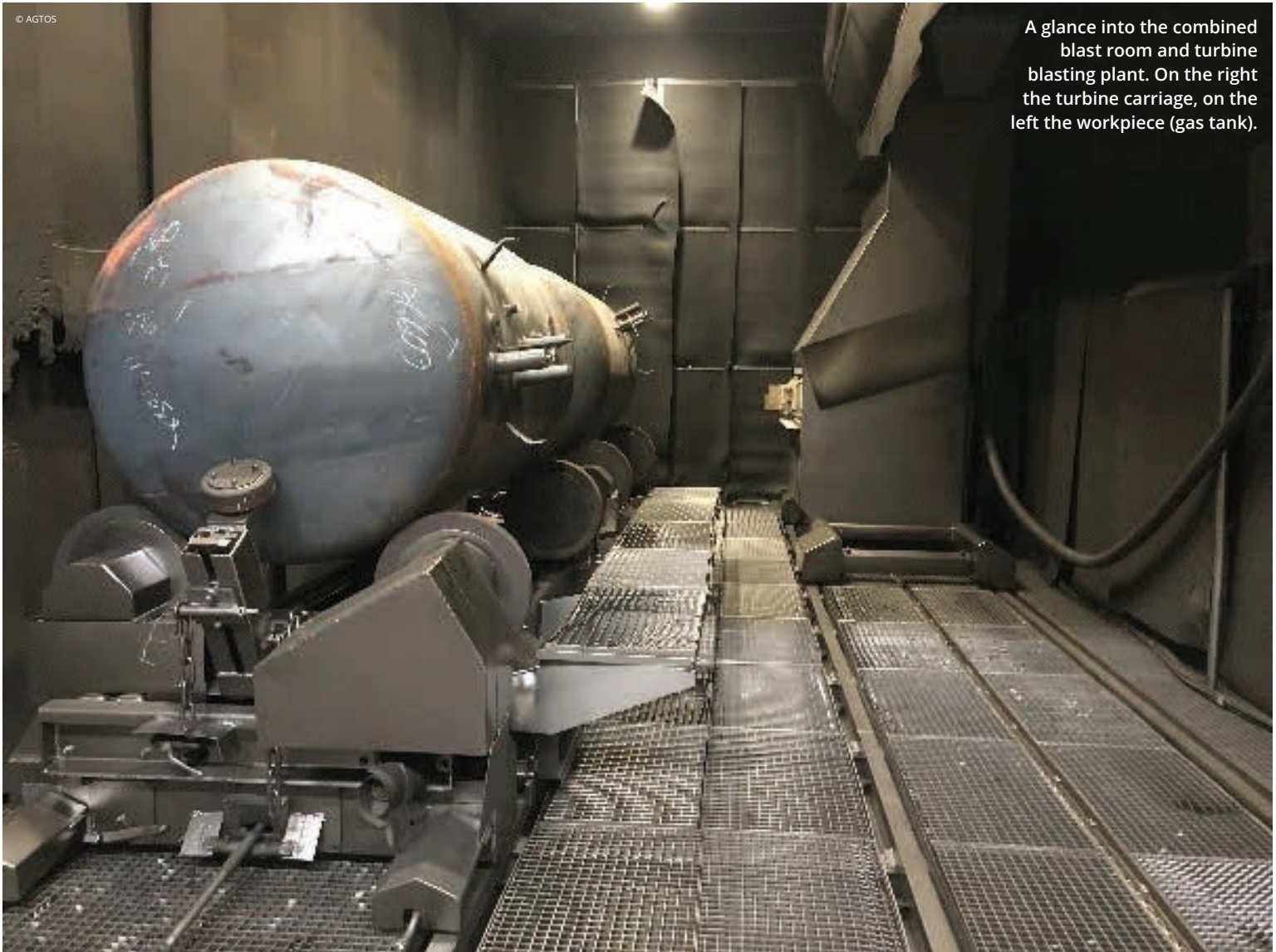
A glance into the combined blast room and turbine blasting plant. On the right the turbine carriage, on the left the workpiece (gas tank).

Of course, in addition to various product-related certifications, the company has a certified QA system according to DIN EN ISO 9001 and UM system DEN EN ISO 14001. The blasting process