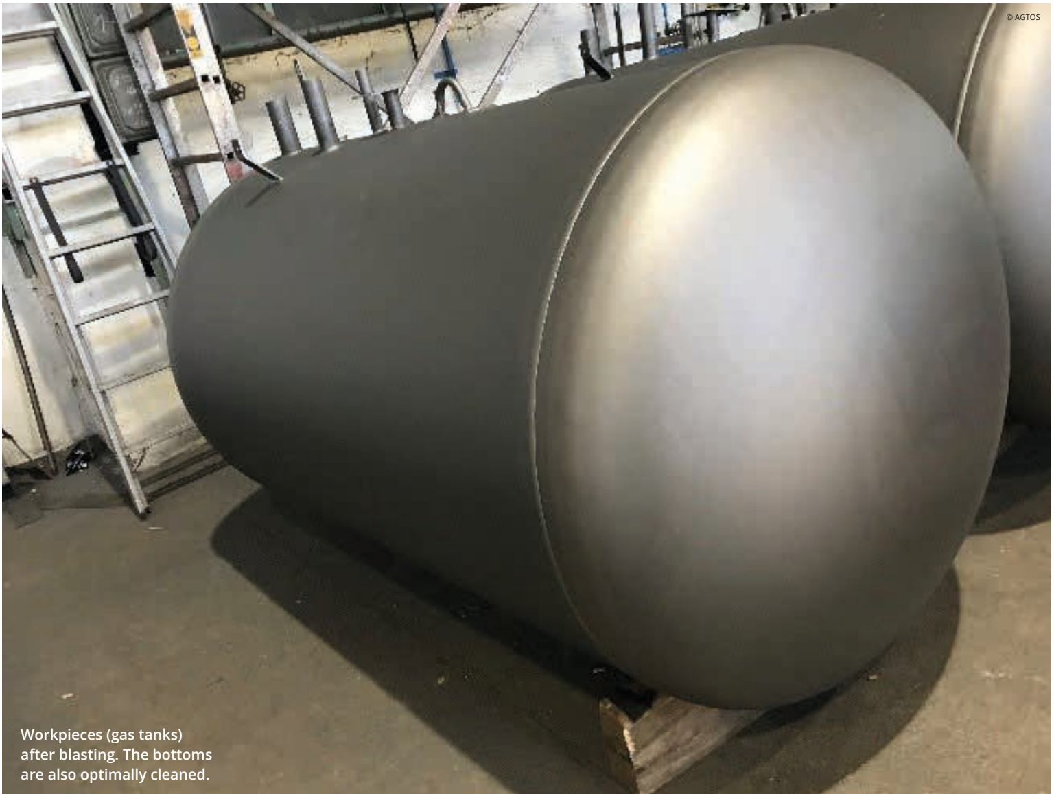
Workpieces (gas tanks) after blasting. The bottoms are also optimally cleaned.

is essential for cleaning and roughening the workpiece surfaces before coating. For this purpose, the company has been operating a combined blast room and turbine blasting plant for years.